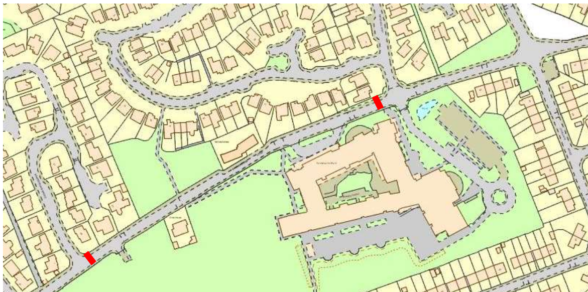
Extent of Restriction

Diversion: Church Street-Cemetery Road- Tranent Mains Road