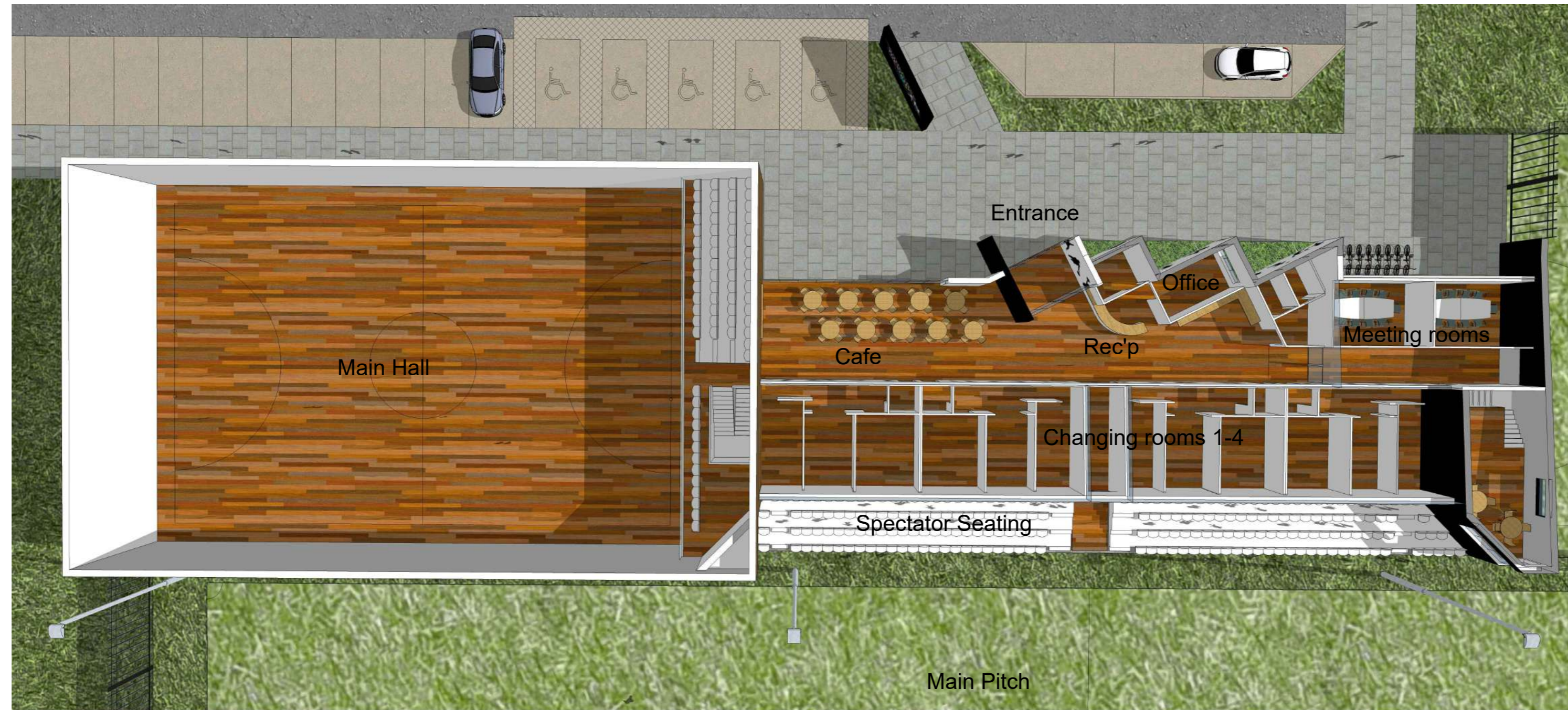
3D View 9: 3D Plan