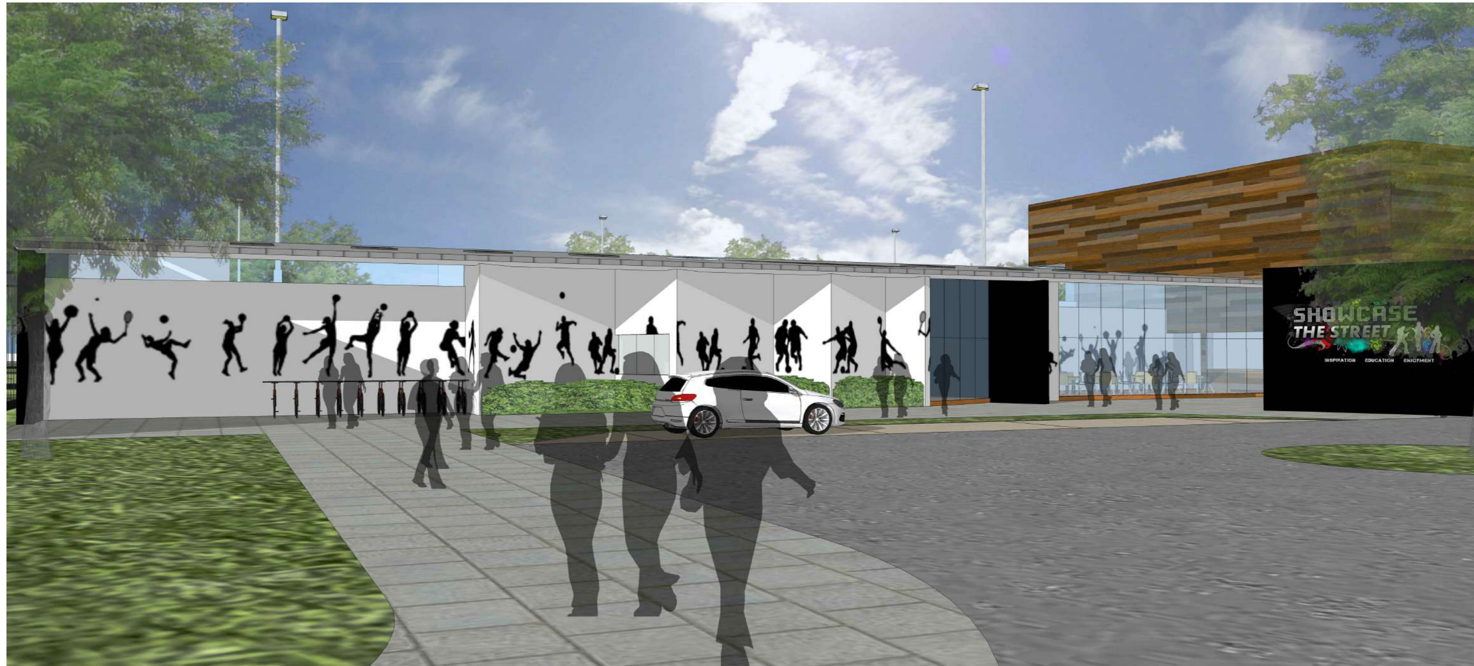
3D View 7: View from North