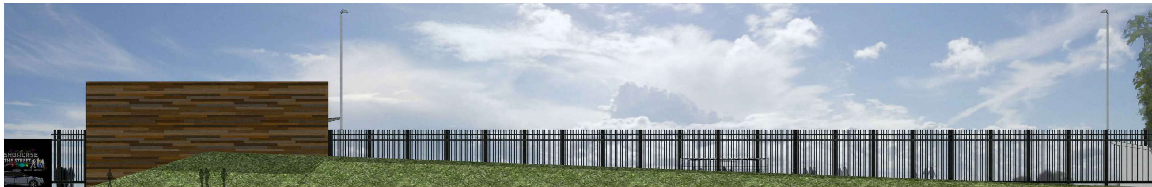
West Elevation (Side)