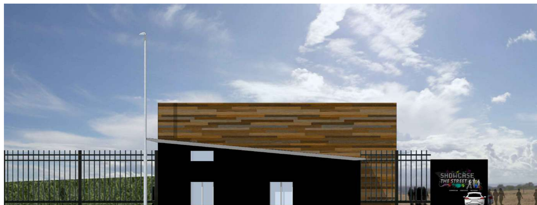
East Elevation (Side)