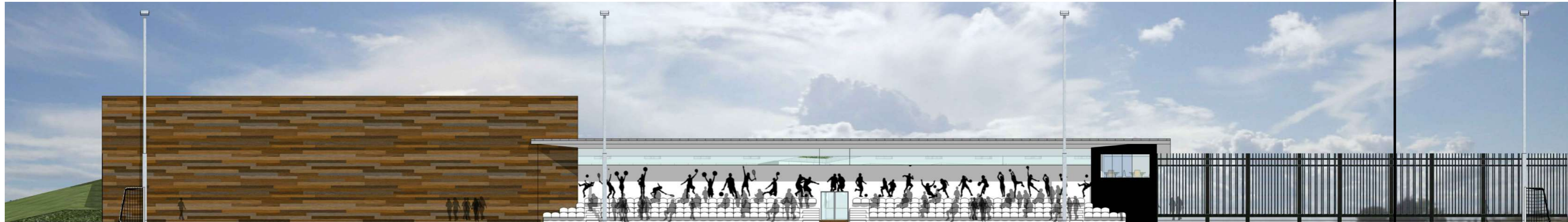
South Elevation (Rear)