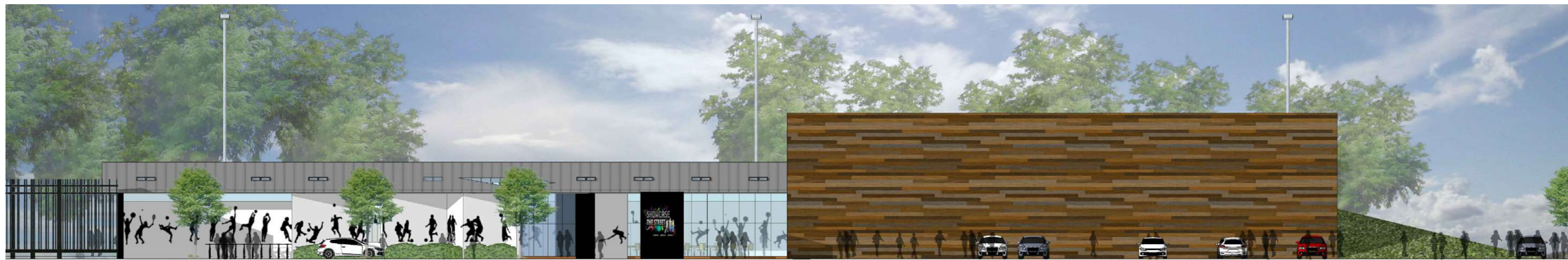
North Elevation (Front)